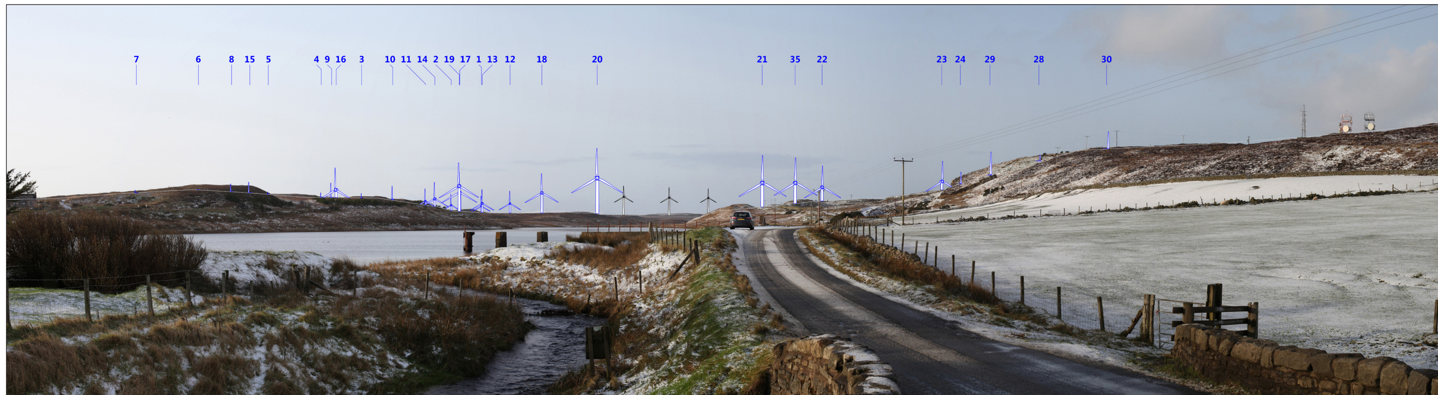
90° Indicative Photowire from Viewpoint Location

Note: The terrain data used to produce the wireline does not take into account the screening effects of any localised landform, vegetation and built-form.