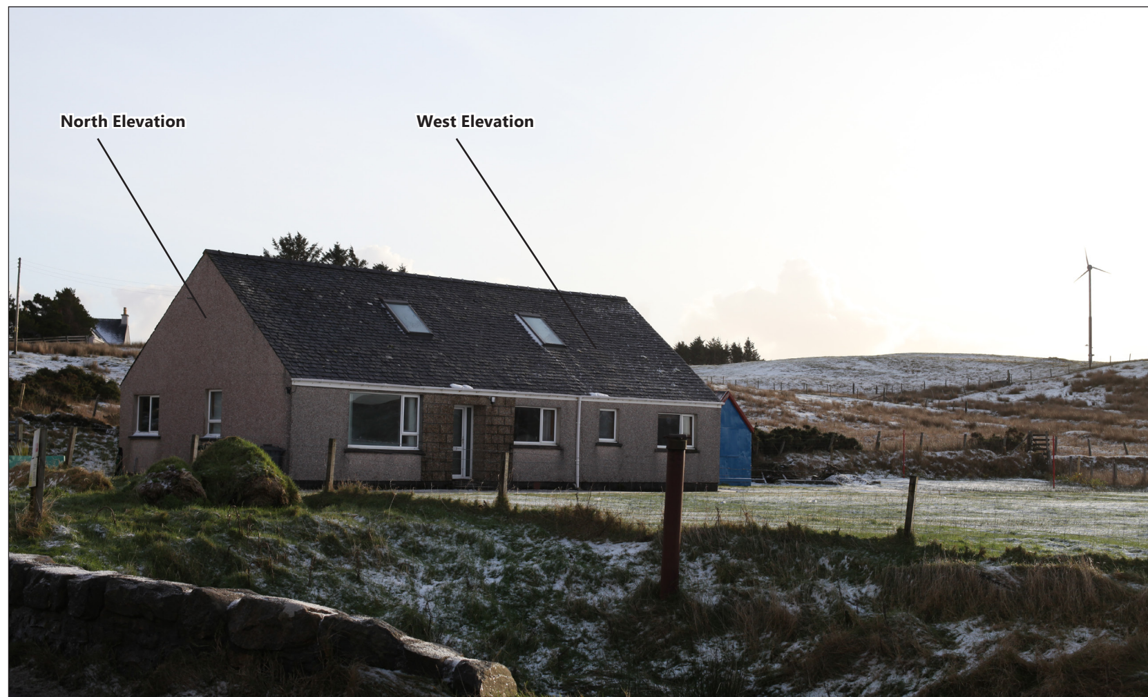
No.10 - Loch View

Note: The terrain data used to produce the wireline does not take into account the screening effects of any localised landform, vegetation and built-form.