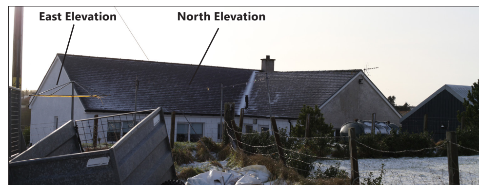
No.16A (Upper Newvalley)