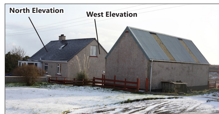
No.16 (Upper Newvalley)