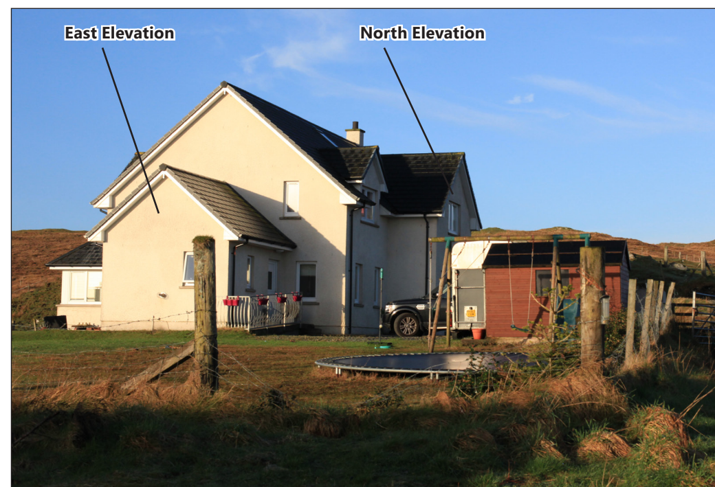
No.16B - Croft House

Note: The terrain data used to produce the wireline does not take into account the screening effects of any localised landform, vegetation and built-form.