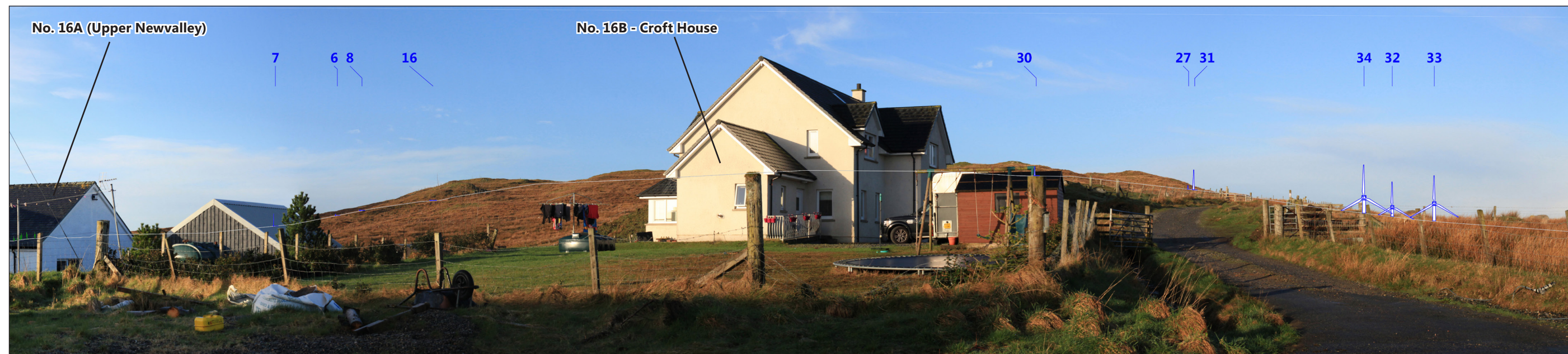
90° Indicative Photowire from Viewpoint Location

Note: The terrain data used to produce the wireline does not take into account the screening effects of any localised landform, vegetation and built-form.