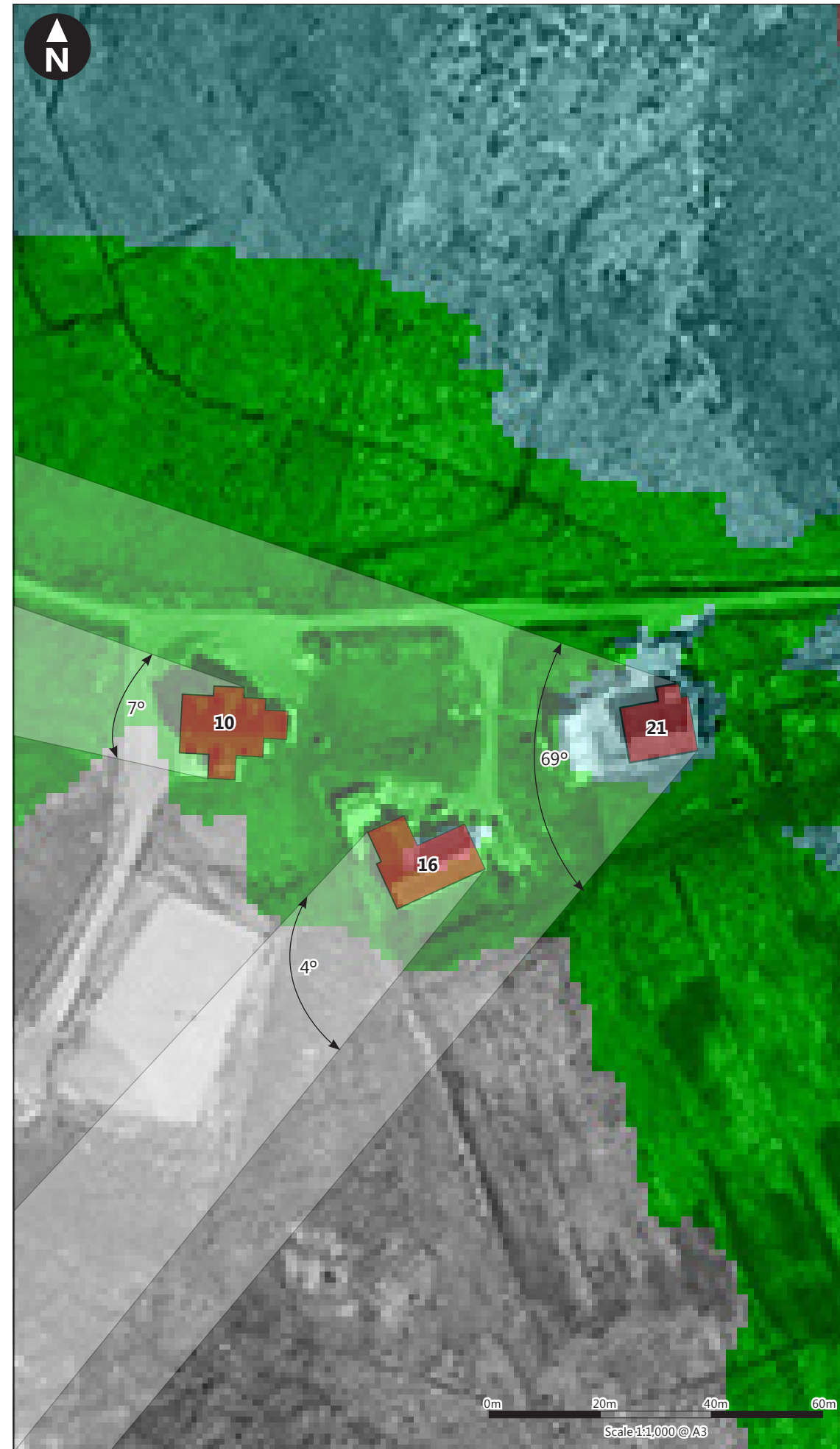
No.16B - Croft House, No.16A Upper Newvalley, No.16 Upper Newvalley - Aerial Photograph with ZTV