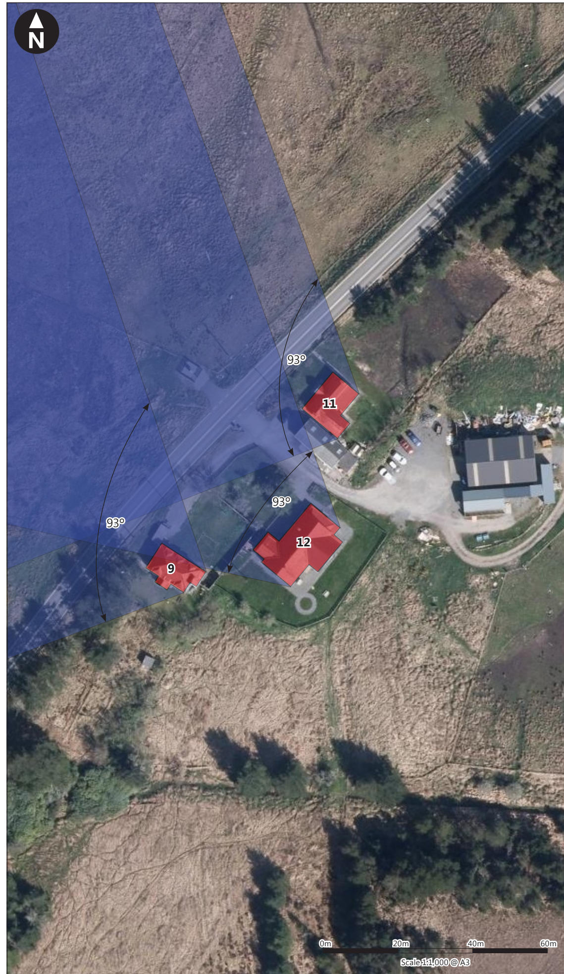
Old Farm House, Macs Croft & Sporting Lodge - Aerial Photograph