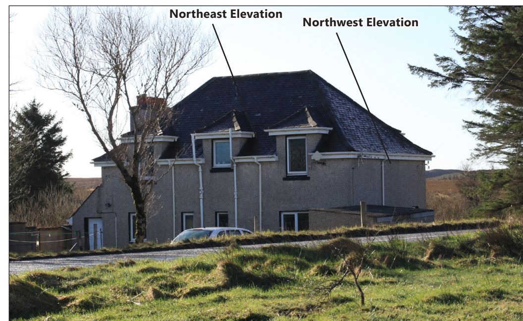
Old Farm House