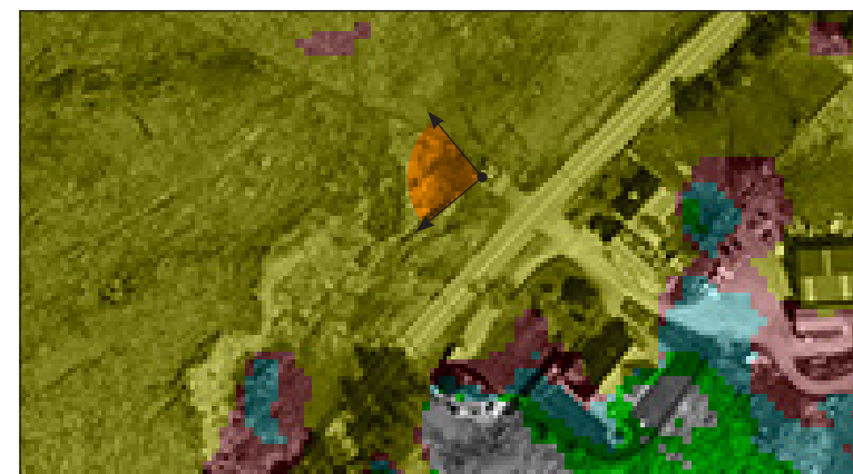
Map of Viewpoint Location