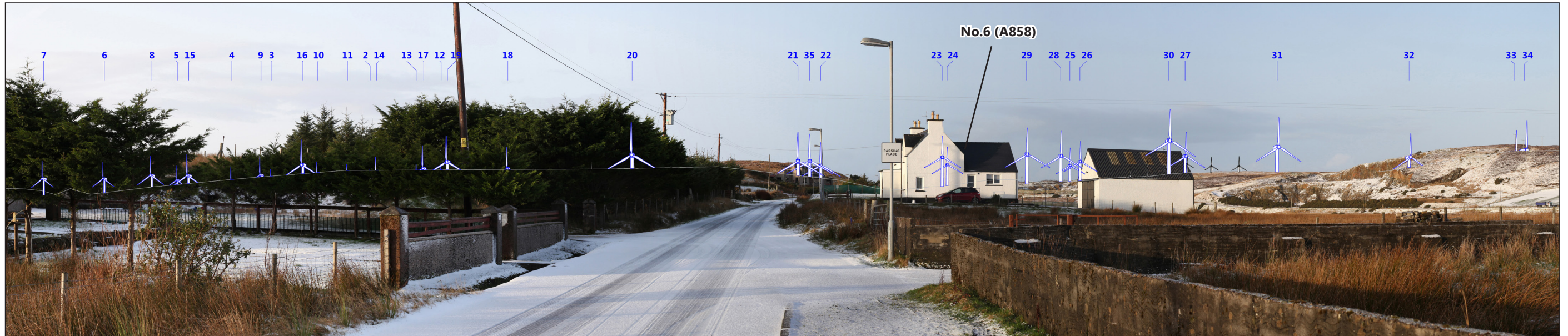
90° Indicative Photowire from Viewpoint Location

Note: The terrain data used to produce the wireline does not take into account the screening effects of any localised landform, vegetation and built-form.