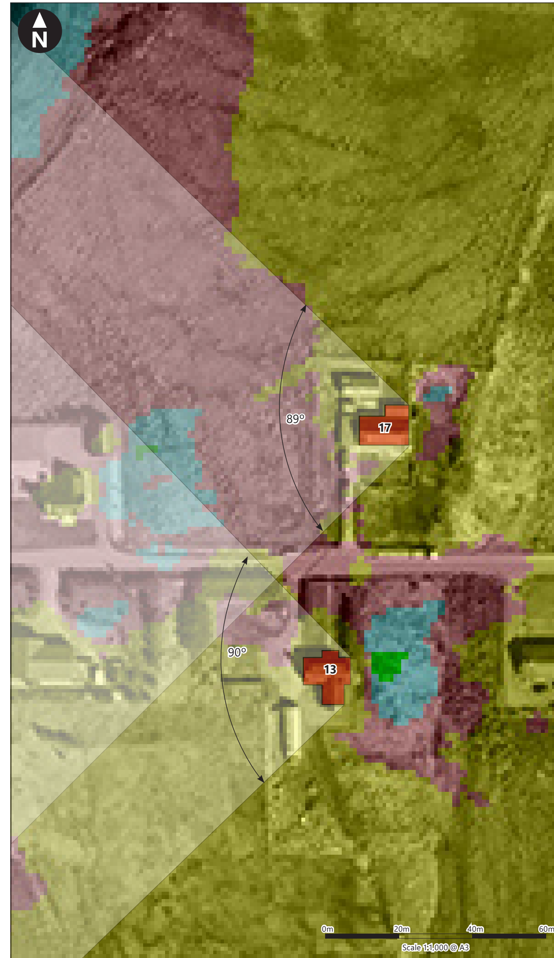
No.13 (A858) & No.6A (Lochan) - Aerial Photograph with ZTV