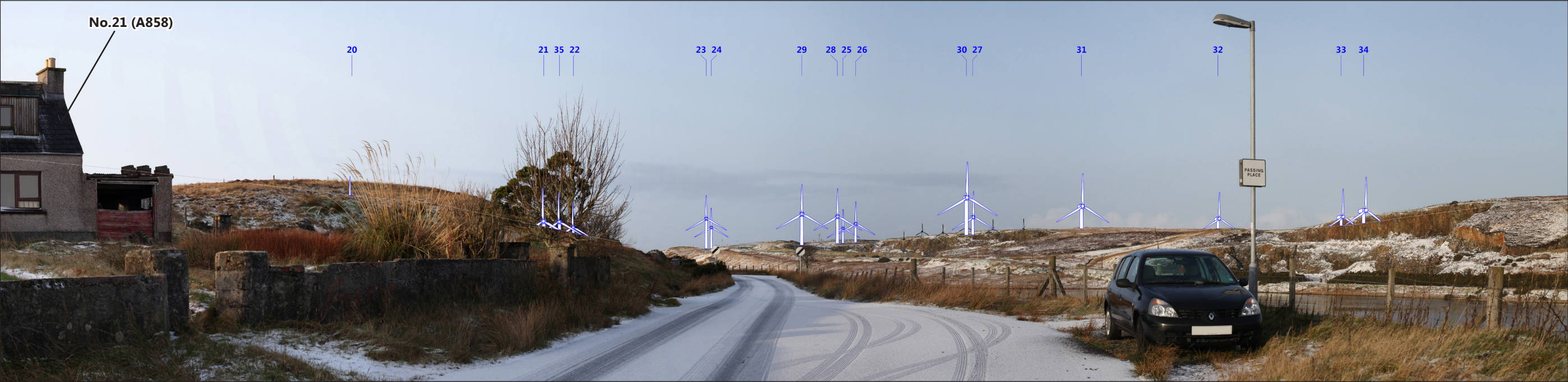
90° Indicative Photowire from Viewpoint Location

H:\data\Projects\40001 Stornoway Optimisation Feasibility Study\040\Drawings\40001-GOS294.indd Originator: wilsc03