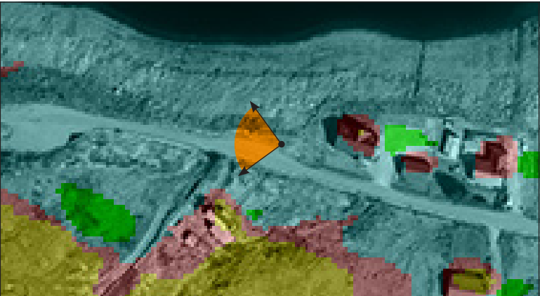
Map of Viewpoint Location

Note: The terrain data used to produce the wireline does not take into account the screening effects of any localised landform, vegetation and built-form.